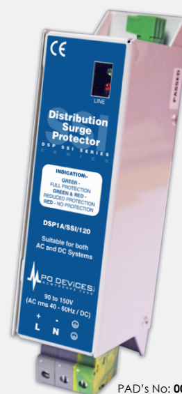
PAD's No: 0086/000060